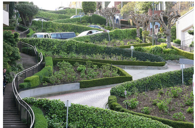
Lombard Street - A must see attraction

SOME OF THE BIGGEST TECHNOLOGY AND INTERNET GIANTS GREW OUT OF BAY AREA HUMBLE BEGINNINGS - HEWLETT PACKARD, GOOGLE, YAHOO, ORACLE, INTUIT, INTEL, CISCO SYSTEMS, EBAY, CRAIG'S LIST, MONSTER.COM ETC