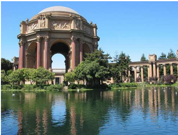
Palace of Fine Arts and Exploratorium