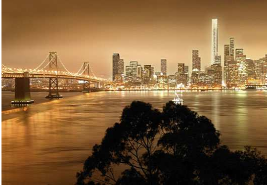
Partial View of San Francisco Skyline & Bay Bridge