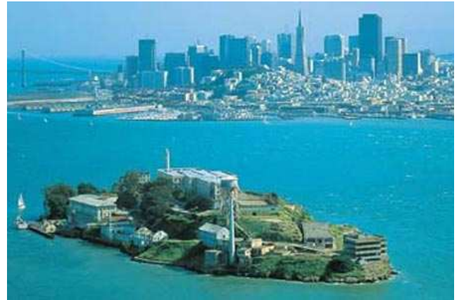
Alcatraz Island, Site of the Movie 'The Rock'