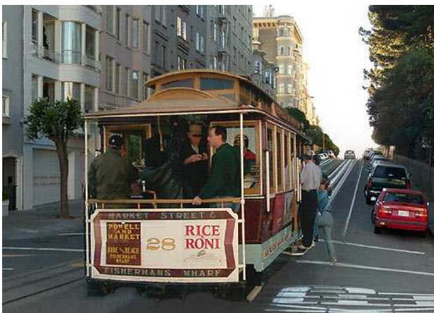
Typical San Francisco Cable Car