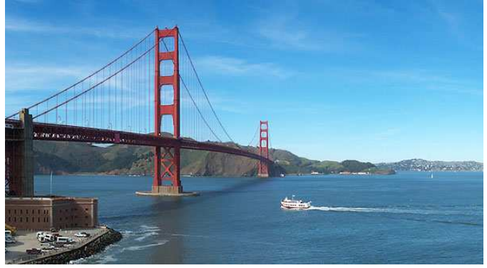
San Francisco Bay Cruise Passing Below Golden Gate Bridge