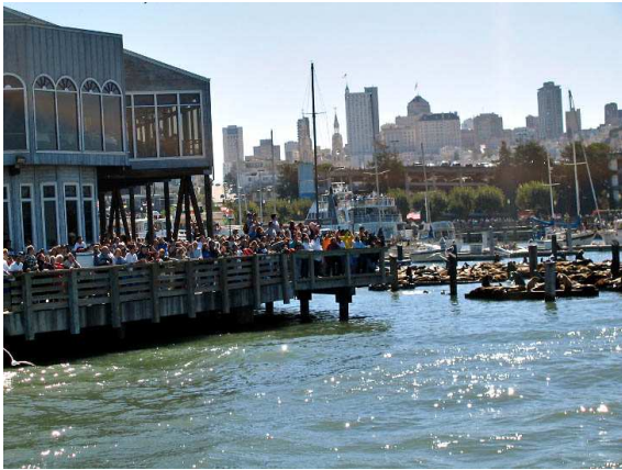
Tourists at Fisherman's Wharf