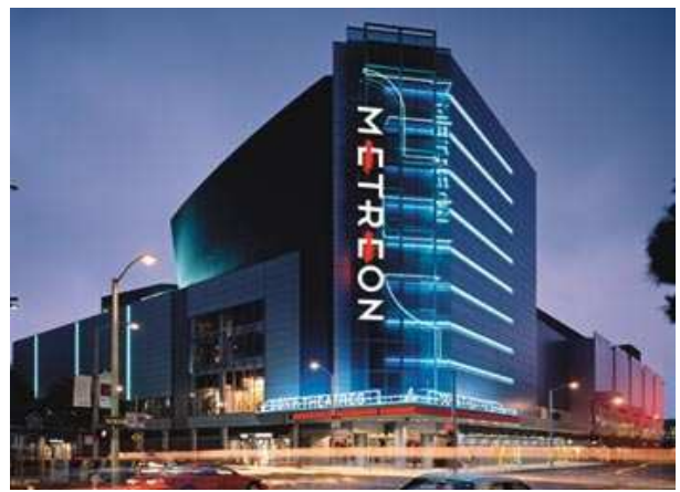
Sony Metreon Entertainment Complex