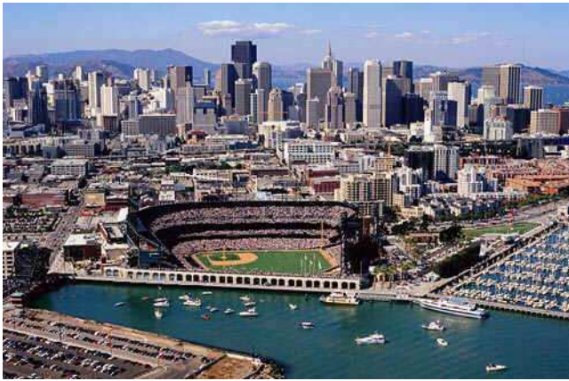
AT&T Park - Home of San Francisco Giants Baseball Team