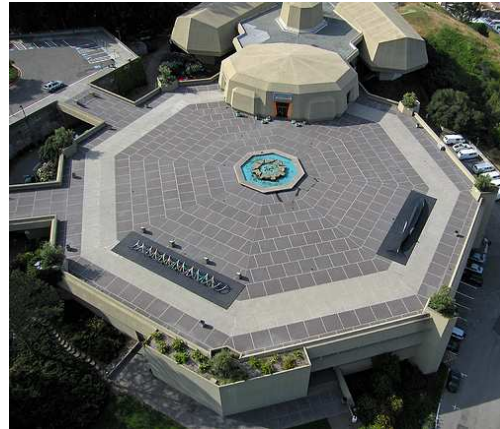
Lawrence Hall of Science